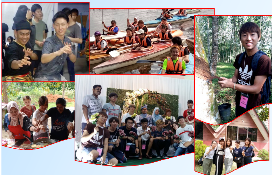
AIMST Inbound Mobility Programme