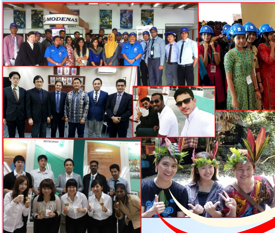
Study Visit with Internship Programme

Certificate of Completion will be awarded to all participants upon successful completion of each programme. The medium of instruction and communication are conducted in English language.