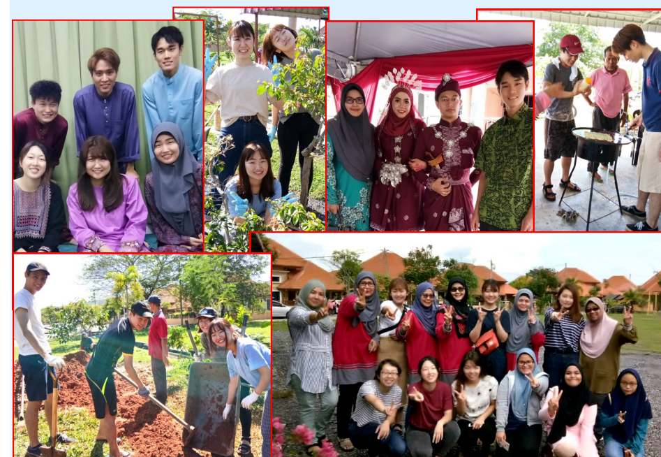
International Students Participated in Homestay & Local Community Activities

The admission is according to every semester intake date and the duration of the course is 2 months (8 weeks).