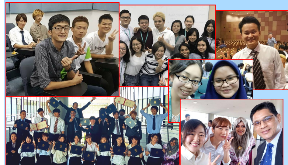
Semester Study Abroad & English Enrichment Programme (EEP)